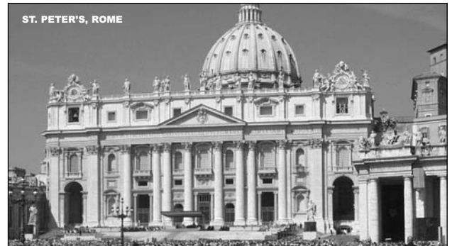
ST. PETER'S, ROME