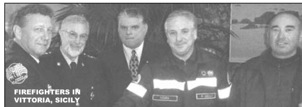
FIREFIGHTERS IN VITTORIA, SICILY