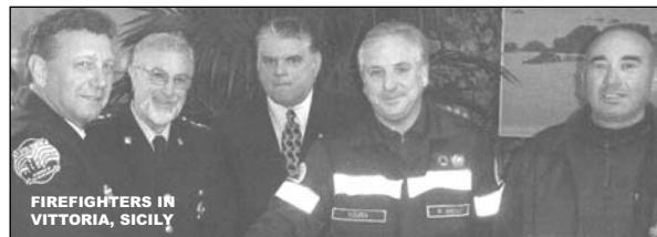
FIREFIGHTERS IN VITTORIA, SICILY