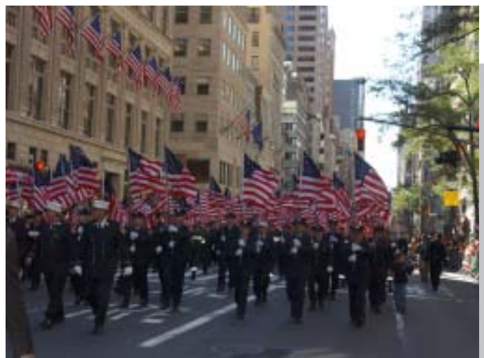
Remembering our brothers. One flag for each fallen 9/11 member, a total of 346 flags.