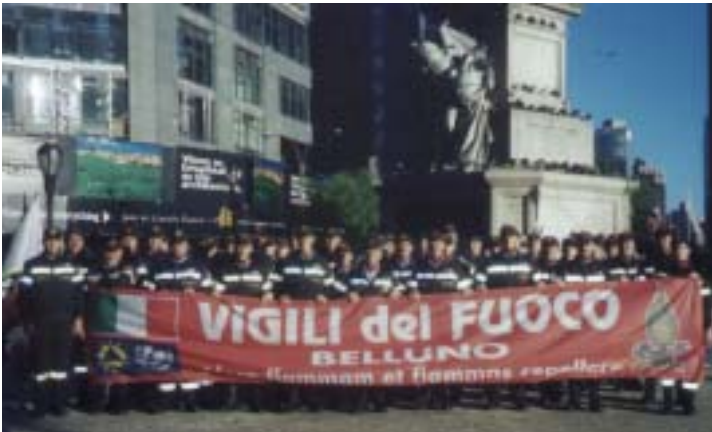
Members of the Belluno, Italy Fire Department crossed the Atlantic Ocean and joined our members and marched in the Columbus Day Parade.

"The Procession of Honor" which included families and company members of fallen firefighter, marched through this "Sea of Blue" with great pride. Members of the Columbia Association carried our colors to symbolize the fallen members of the Columbia Association FDNY.