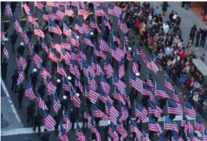
A sea of red, white and blue streaming down 5th Avenue.