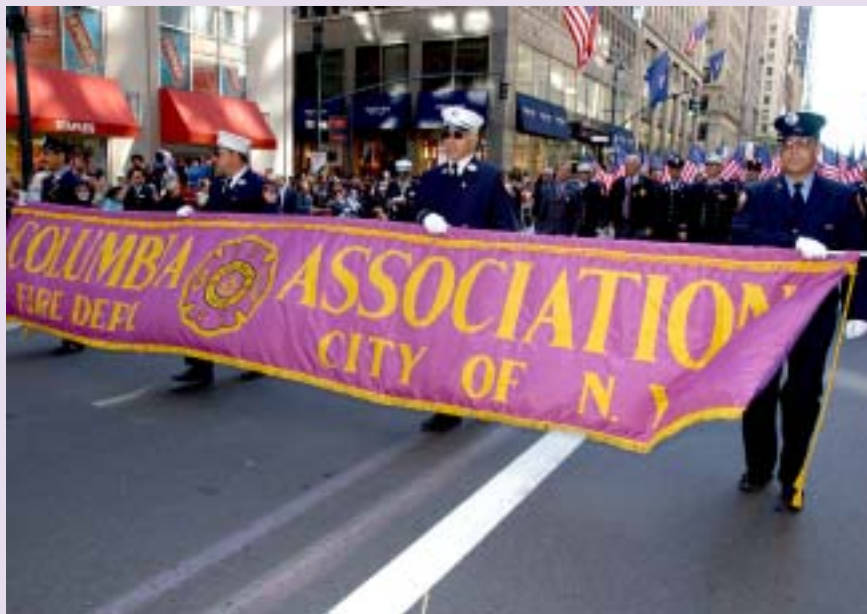
FDNY Columbia Association Members Proudly Hold High our Banner and Lead the Rest of Members Down Fifth Avenue.